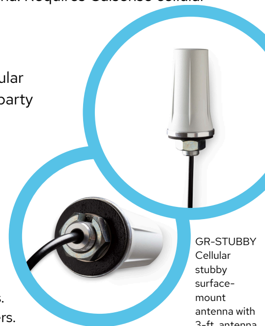
GR-STUBBY Cellular stubby surface-mount antenna with 3-ft. antenna cable